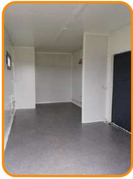
PARTY WALLS & DOORS