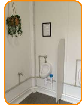
WATER AND SEWAGE INSTALLATIONS